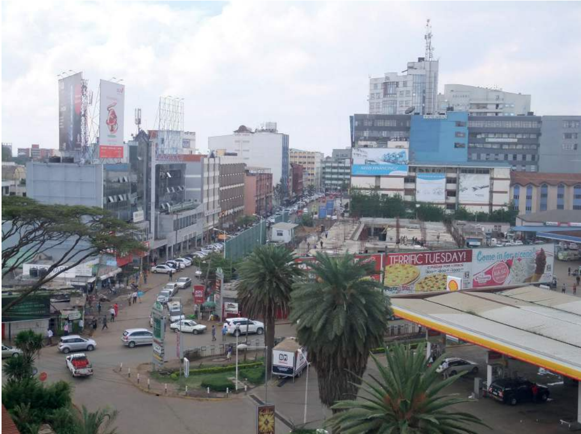
Fig. 3.1 for Question 3